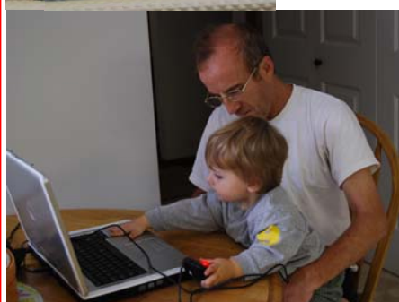
Father and son catch up on email.